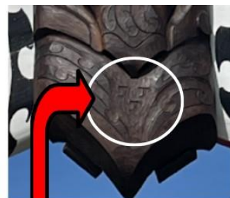
J J J engraved in the tekoteko