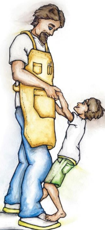
"Jesus & Joseph Sway"

*Shared with permission by the Sisters of Saint Joseph of Carondelet.