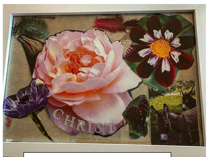
One of the finished posters

On day two, ways of raising our consciousness of love and bringing what we have to our ministry were explored. The final activity was to design a poster to encapsulate the heart of each person's Josephite ministry.