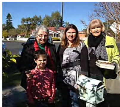
Figure 22 The Present and the Future