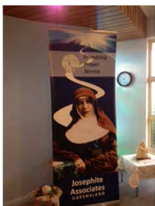
Figure 7 The new Associates' Banner

The atmosphere in the meeting was positive and affirmed the way forward for the future of the Associates. There were people there who had never heard of the Josephite Associates so it was an opportunity for them to ask their questions, take a brochure and hopefully, continue to commit themselves to living a life of Prayer, Friendship, Service. We saw Service in action from the group who prepared the venue, the food and did the clean-up.