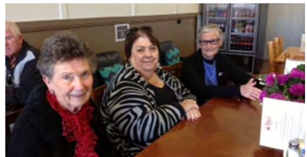
Figure 21 Friends Enjoying lunch