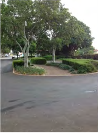
Figure 2 First Stop - lovely spot in Childers

6.30 am saw us leaving Brisbane for the Road Trip that was to take us to Cairns and all parts in between. It was a foggy morning with intermittent rain but we set out with pilgrim hearts ready for the adventure ahead. Even if we weren't travelling on horseback like Mary MacKillop and the early Sisters, we felt her presence as we travelled along.