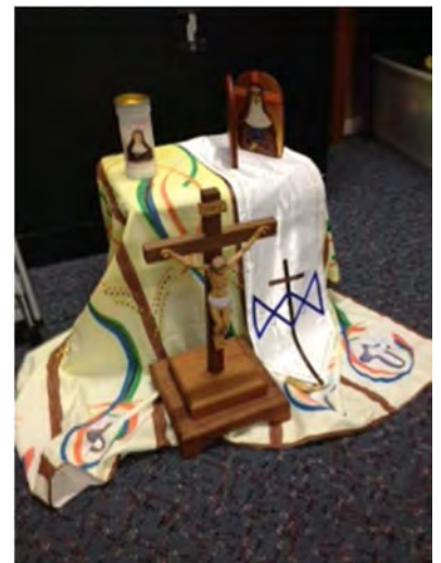
Figure 8 Prayer focus for the meeting

We presented our PowerPoint outlining the significant changes happening within the Associates organization. Participants were receptive of these changes which provoked many questions and comments.