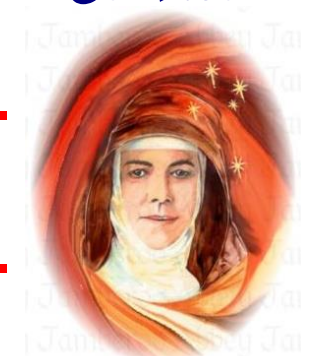
'Do all you can to assist and love one another.' MMK 1890