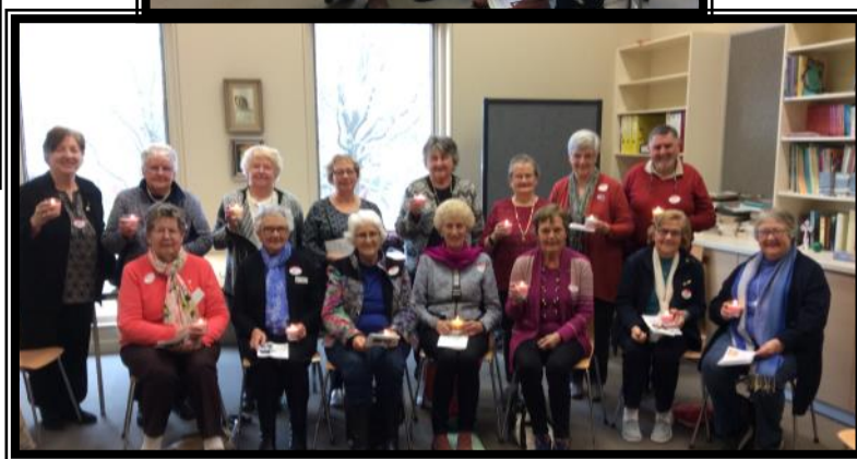
Top Right: Receiving the new prayer card