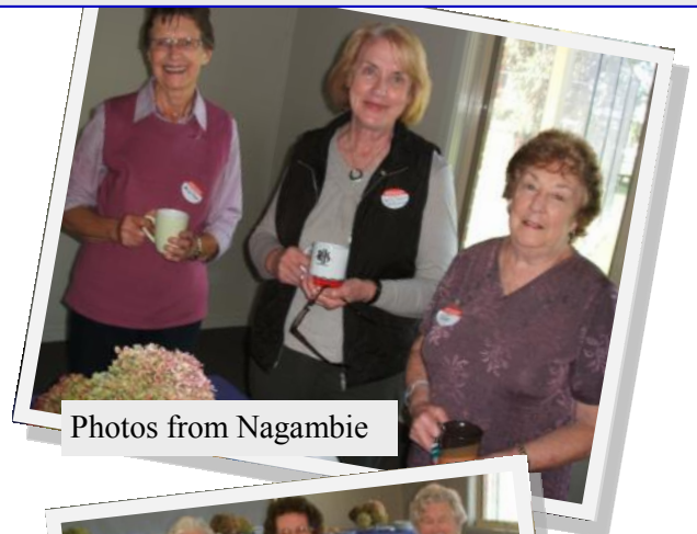
Photos from Nagambie

We look forward to the next Regional Day at Mary MacKillop Heritage Centre on 14th June.