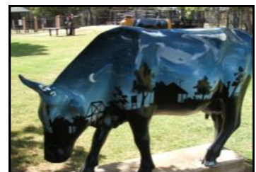
One of the decorated cows at the Park in Murchison