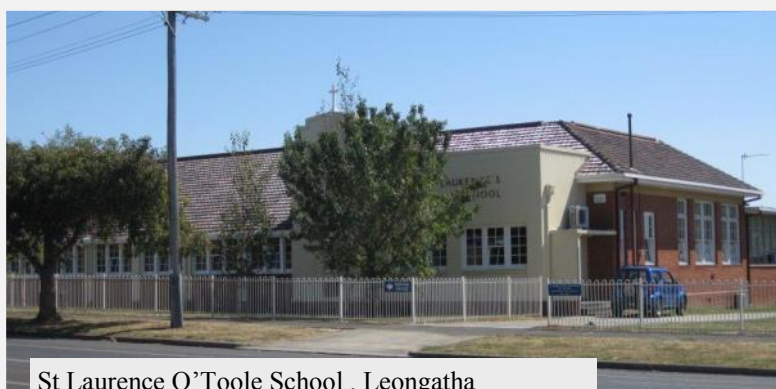
St Laurence O'Toole School, Leongatha