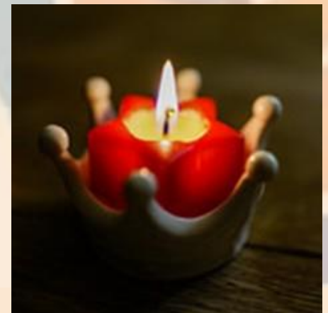
"Advent" by mripp is licensed under CC BY 2.0.

We light the second candle for the peace that sings in our hearts, that God's reign is near.