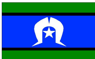
Torres Strait flag