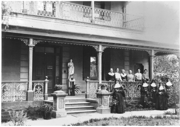
St Joseph's Providence at 32 West Terrace with some of the residents ca 1910. The Catholic Church bought this house in 1905 and it remained a House of Providence until 1951.