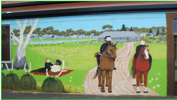
Mary MacKillop Memorial School, Penola

Slowly pray the following prayer as Mary MacKillop would have prayed these words