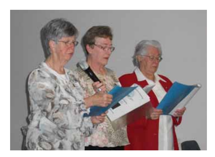
AGM Praying for the JA RIP Members 2011