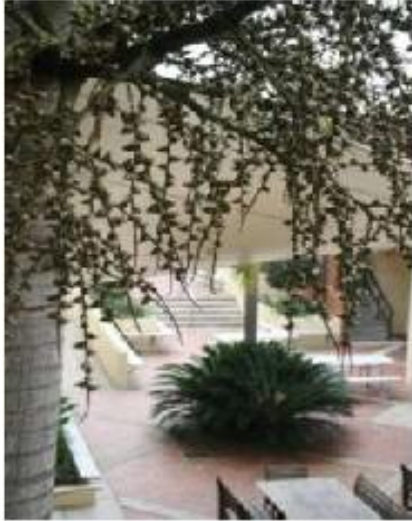
The O'Shea Centre

Please return your registration form to Sisters of St Joseph 10 Bayview Terrace Wavell Heights Qld 4012