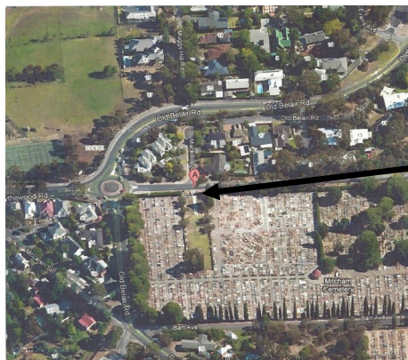
Left A map showing the entrance gates to the cemetery

The Sisters’ cemetery at Mitcham has been recently upgraded and a memorial wall has been constructed from bricks that came from the convent that was once located on the land. It is a beautifully spiritual place to be as the setting sun echoes the end of the day. What a perfect location to share some stories relating to some of the Sisters who have gone before us.