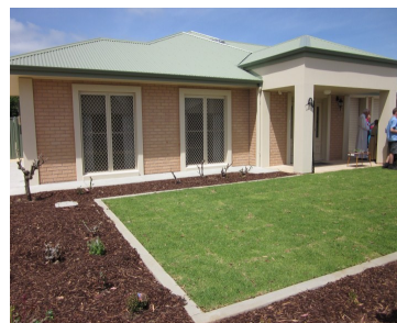
The new convent at Penola