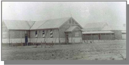
Southern Cross Circa 1906