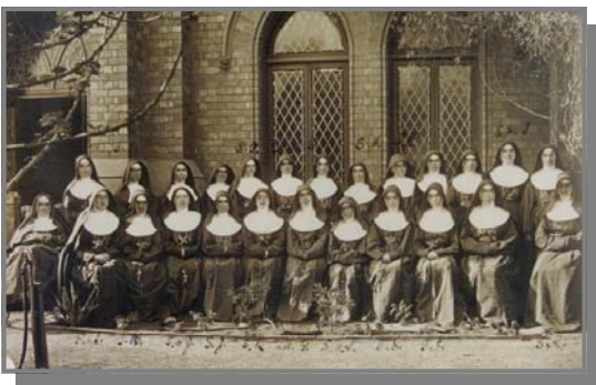
Boulder Community Circa 1912

1 November, 2012 is a significant date in the history of the Josephite Congregation as it marks the 100 th Anniversary of the Amalgamation of the Western Australian Boulder Josephite Diocesan Sisters (known as the Black Josephites) with the Central Sisters of St Joseph of the Sacred Heart (known as the Brown Josephites)