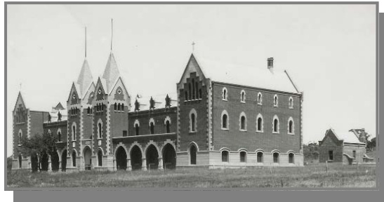
New Norcia Circa 1908

Many changes followed the Amalgamation. The large Boulder community was broken up, some stayed on the Goldfields while some were transferred both within and beyond WA. At the time there were Brown Josephites at Southern Cross and New Norcia. There are still many Sisters throughout the Congregation today who have lived in community with the former Black Josephites and who fondly and reverently remember them.