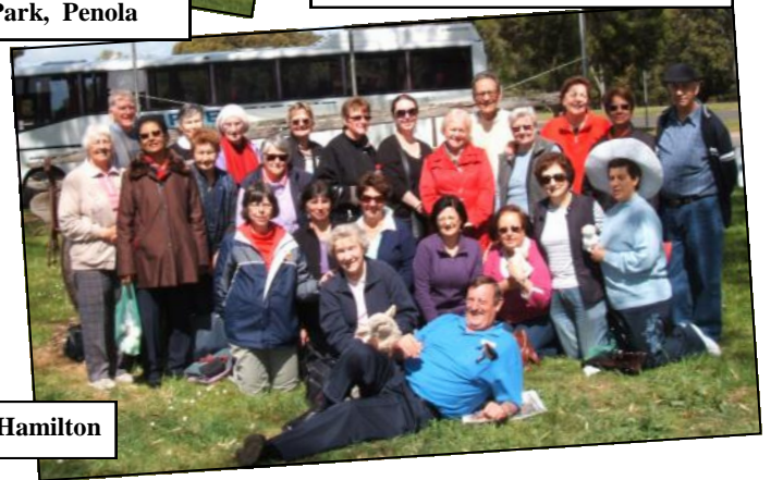
Pilgrims at Hamilton