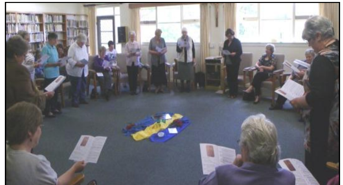
Associates making their Commitment