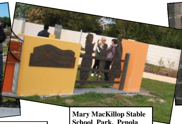
Mary MacKillop Stable School Park, Penola