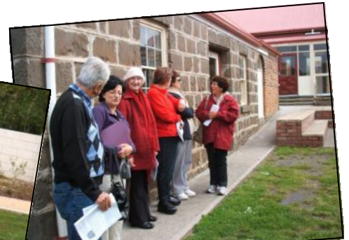
Stable - Bay View House, Portland