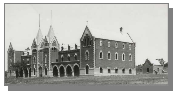
New Norcia Circa 1908

Many changes followed the Amalgamation. The large Boulder community was broken up, some stayed on the Goldfields while some were transferred both within and beyond WA. At the time there were Brown Josephites at Southern Cross and