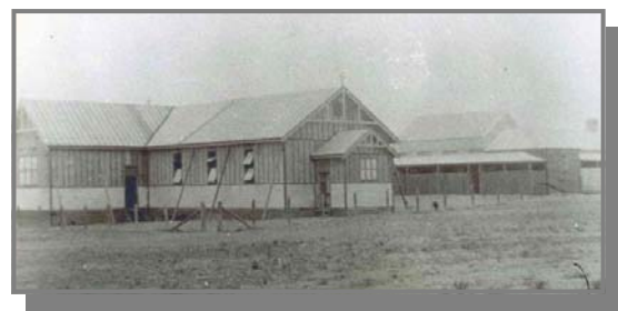
Southern Cross Circa 1906