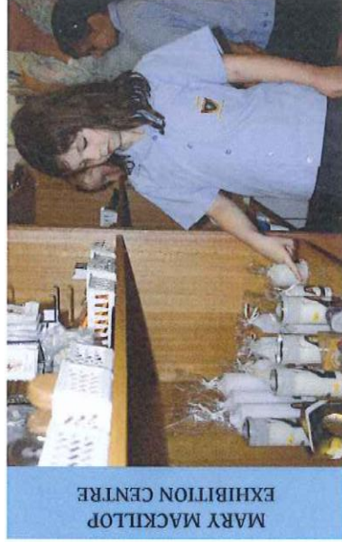
MARY MACKILLOP EXHIBITION CENTRE