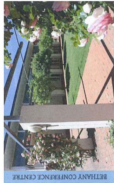
BETHANY CONFERENCE CENTRE