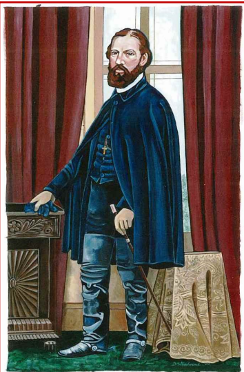
Julian Edmund Tenison Woods 1832 - 1889

We lift our hearts in thanksgiving for the life of Julian Tenison Woods who, as priest and missionary, travelled this land and ministered to families. We remember with gratitude his gifts as co-founder of the Sisters of St Joseph and pastor, his passion for mission, his reverence of earth, his respect for the Aboriginal peoples, and his love of God.