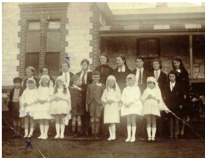
1935 First Communicants and Boarders at Port Lincoln

Thank you for allowing me to be part of your lives. May God bless you abundantly!