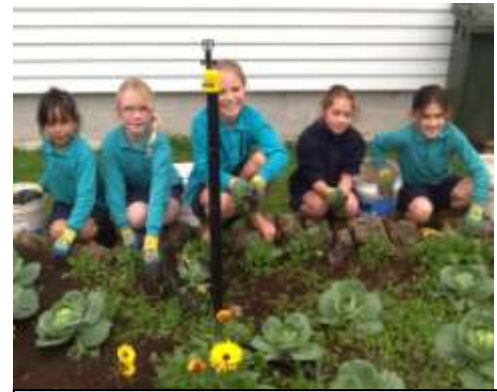
St. Francis Xavier Junior Joeys

The JCA leadership team would like to encourage Josephite schools in New Zealand to establish Junior Joey programmes.