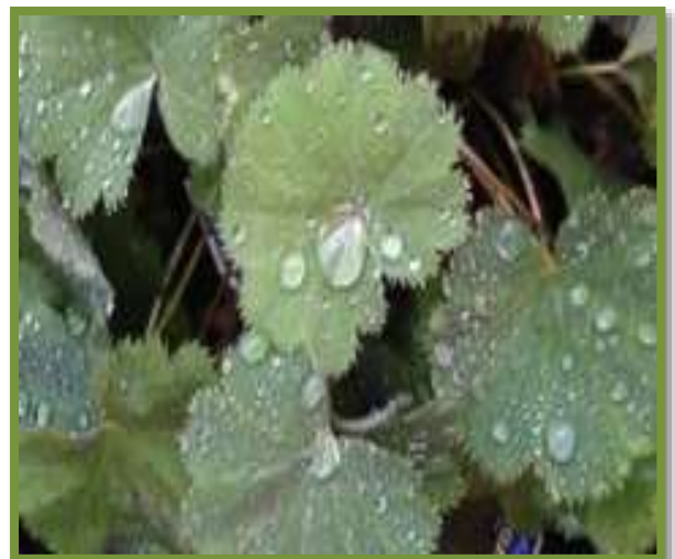
Lady's Mantle -a herb 'doing a new thing' in a warmer than usual winter climate. Taken on 26 May, 2015