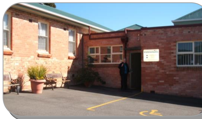
The Emmanuel Centre, formerly a Boarding School conducted by the Sisters of St Joseph, Tasmania