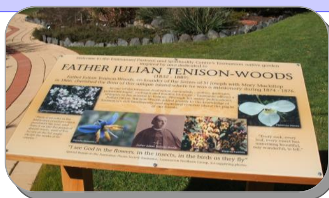
Fr Woods garden at Emmanuel Centre, Launceston