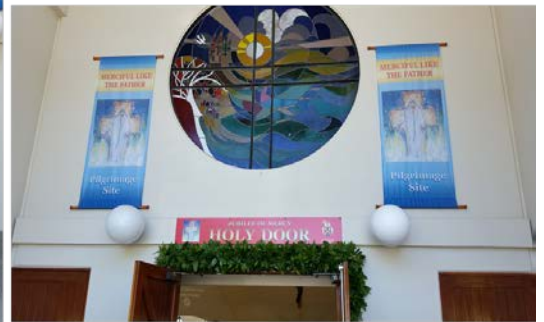
The Opening of the Door of Mercy at Sacred Heart Church, Clear Island Waters on Friday 12, Feb. The Church has been designated as one of the pilgrimage sites in the Diocese during the Jubilee Year of Mercy

" The God of Mercy, whose door it is, is always home. ... You only have to knock once and you only have to knock gently. The Door of mercy rests on the threshold of need. Its single key is kindness, which is always in the lock Faithfulness is its lintel hope and healing the strong jambs either side."