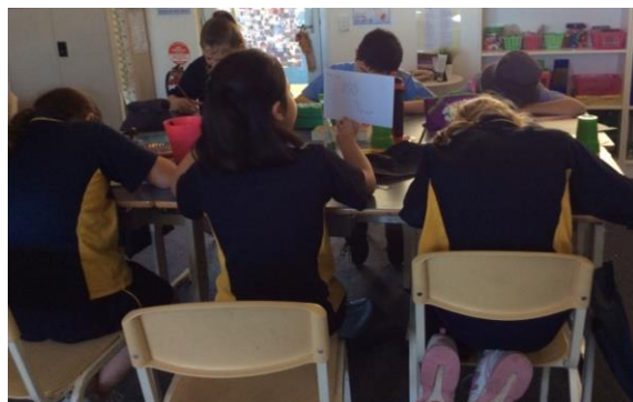
Working on cards to send to the Sisters.