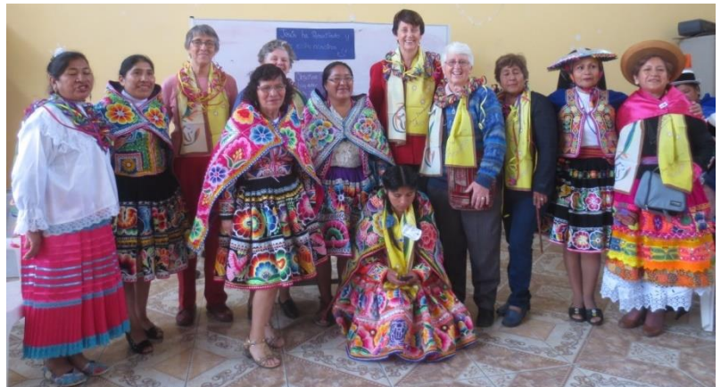
In Pitumarca with some Associates