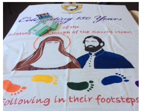
The banner we are working on.