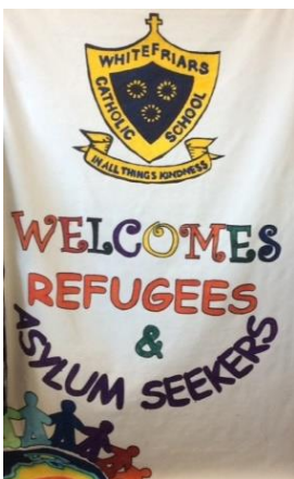
Our banner supporting refugees.

Being Junior Josephites, we can truly say that Mary MacKillop has influenced our school, our group and our daily lives. Following in the footsteps of Mary MacKillop we have been able to contribute our part in making the world a better place.