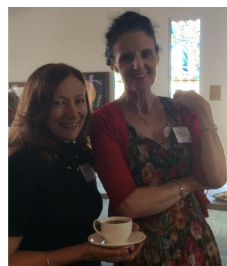
Happy for a photo during morning tea