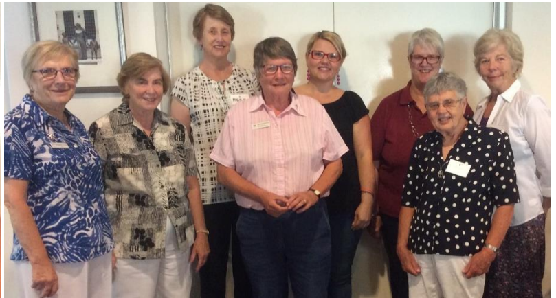
With former staff and volunteers of Catherine House