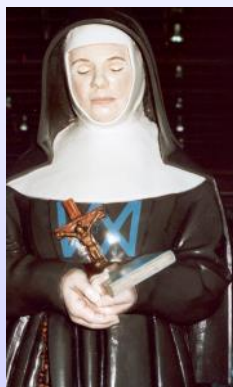
St Francis Church Melbourne

VENUE: Mary MacKillop Heritage Centre 362 Albert St EAST MELBOURNE