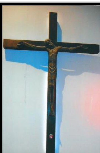
Crucifix with Relic attached