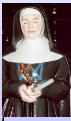
St Francis Church Melbourne