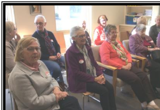
Waiting patiently for the technology to be ready.