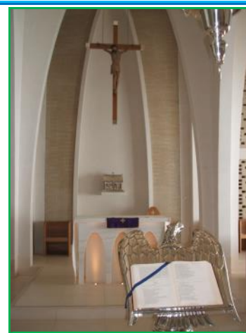
St Mary of the Cross Chapel A.C.U.