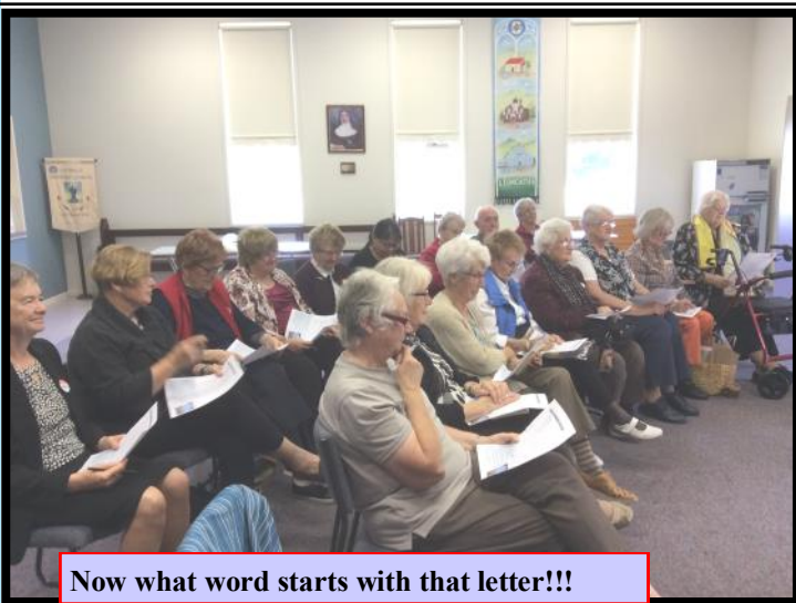
Now what word starts with that letter!!!