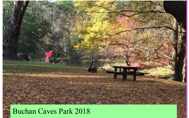
Buchan Caves Park 2018