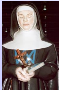
St Francis Church Melbourne