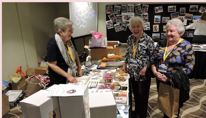
Happy Participants at the Queensland Conference