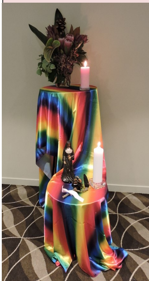
Sacred Space from Queensland Conference