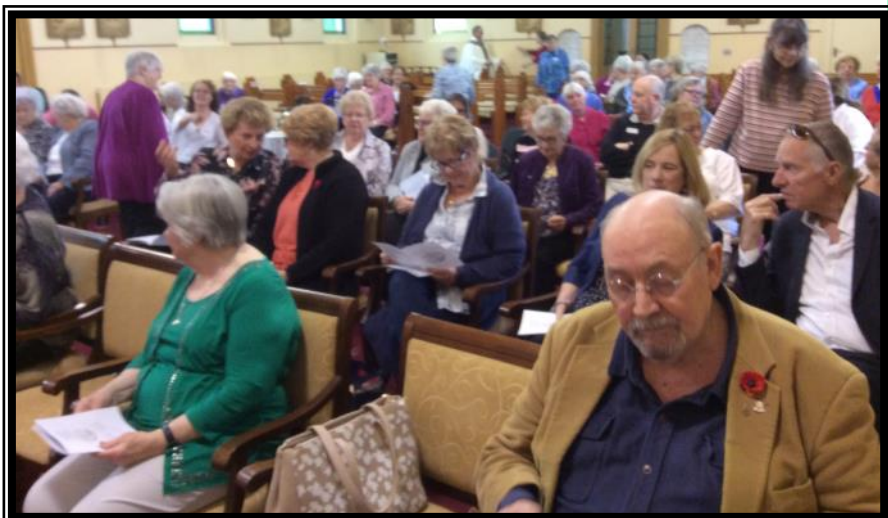
Part of the large crowd waiting for Mass to begin and catching up with friends.