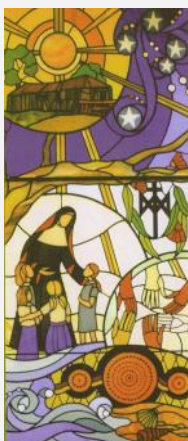
Therese Quinn rsj