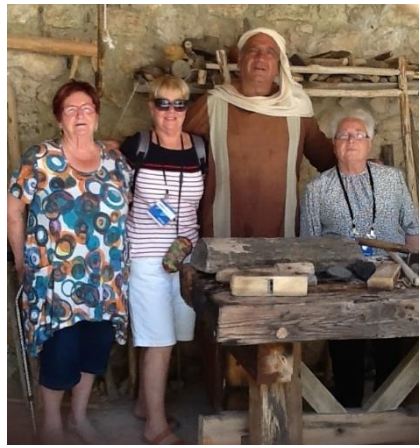
A shepherd in Nazareth. This is a working village illustrating aspects of life in the first century.