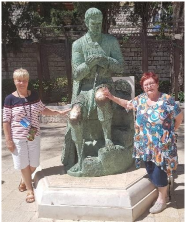
With the great St Joseph at his house.