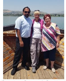
On the Sea of Galilee.

This bronze statue of Jesus was very confronting. The dimensions were taken from the Holy Shroud of Turin and shows the marks inflicted by the soldiers as per the marks identified by the shroud.