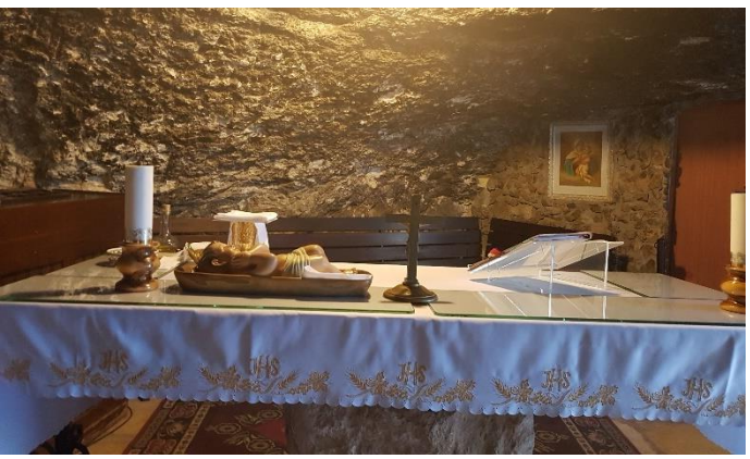
A natural cave at Shepherds' Field which now has a chapel for pilgrims to attend Mass. The field has been identified as the scene where the Angel of the Lord visited the shepherds and informed them of Jesus' birth.