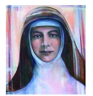
'May God bless and keep you and give you courage.' MMK 1875