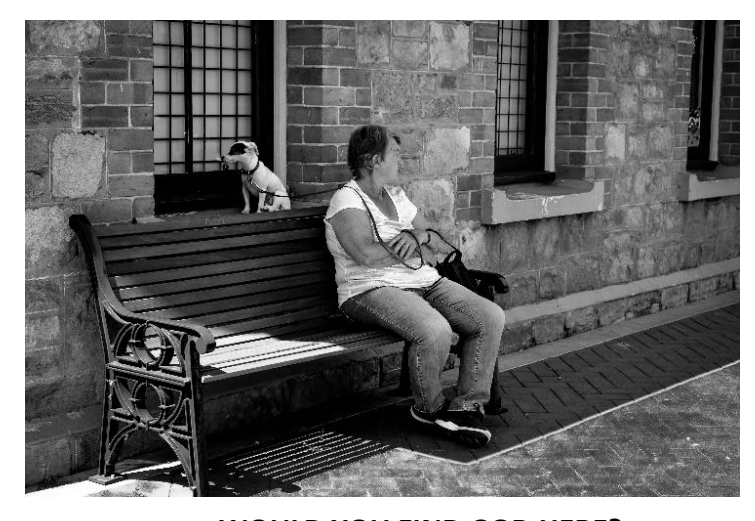
WOULD YOU FIND GOD HERE?

to advocate for equality in our society to live humbly in Earth as our home to be loving, creative and appreciative in the new normal we're living into.