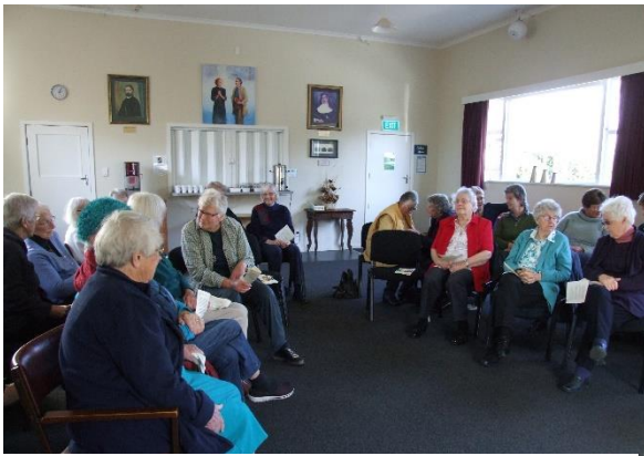
Liturgy at Mt St Joseph's Whanganui