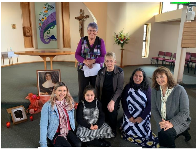
Hibiscus Coast group