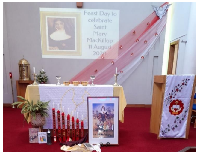
A colourful altar set up in honour of St Mary of the Cross.