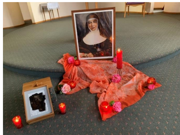
Prayer focus at Mission Bay

Deepest sympathy to all their families. May they rest in peace