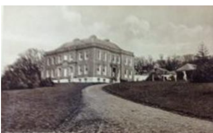
Clare Ahern rsj

To conclude, it was important to revisit the grand old house, to recall its story and to discover the strategies that kept the old building alive and vibrant for 295 years. It teaches us, that survival and living through the new-normal of the pandemic, call for the same strategies of creative changing, adapting and evolving; constant alertness for the new and life-giving; courageous embracing of the opportunities for vibrant metamorphoses while sincerely acknowledging what was, is over and needs leaving behind! And so proclaims the grand old house in the time of a pandemic!