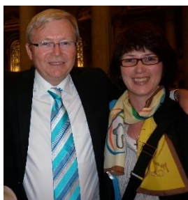
A couple of Aussies at the Mass of Thanksgiving.

Perhaps my happiest memory of my pilgrimage to Rome came on the Monday following the canonisation, when a huge contingent of St Mary's supporters converged on the Basilica of St Paul Outside the Walls for the Mass of Thanksgiving.