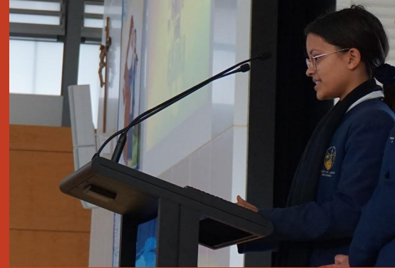
Girls For Ghana