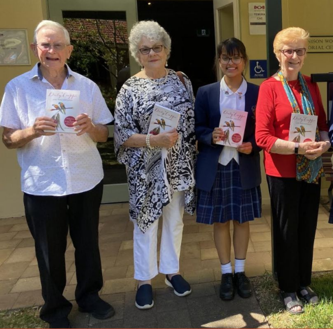
A Daily Cuppa Book Launch