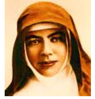
"All will be right with time and a little patience." MMK 1873