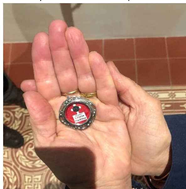
1 st Class Relic at St Mary's Church Hamilton

I will finish with my favourite quote of Mary's, "There where you are you will find God", 1871.