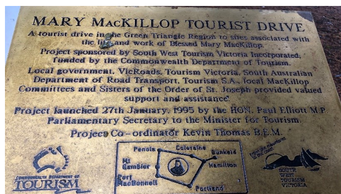
Plaque Of Tourist Drive in the Green Triangle Region