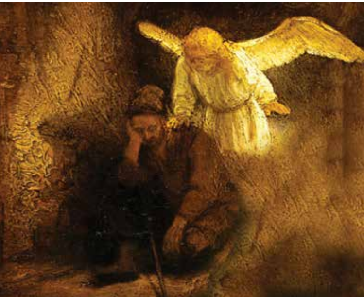
'Joseph's Dream' by Rembrandt