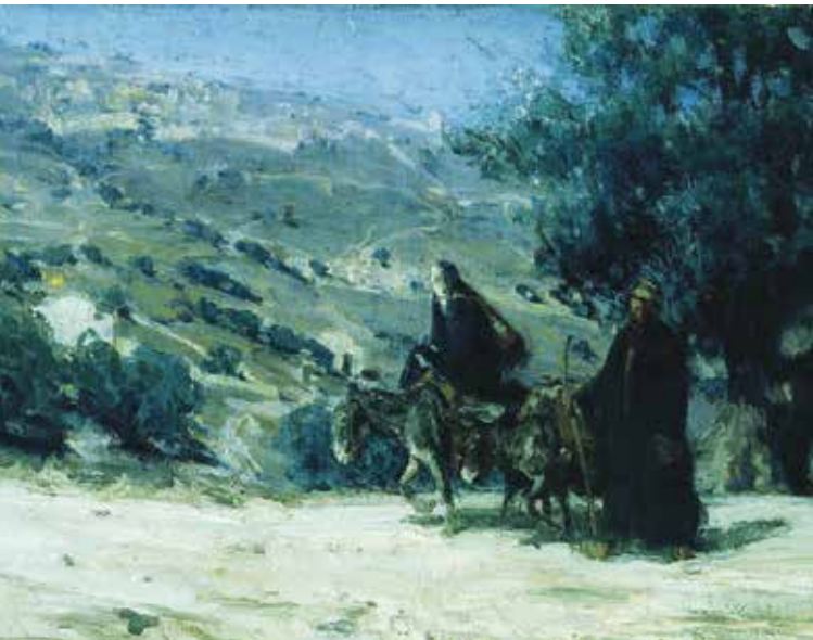
'Flight to Egypt' by Henry Ossawa Tanner

We are mindful of St Joseph who, for the safety of Mary & Jesus, sought refuge in Egypt.