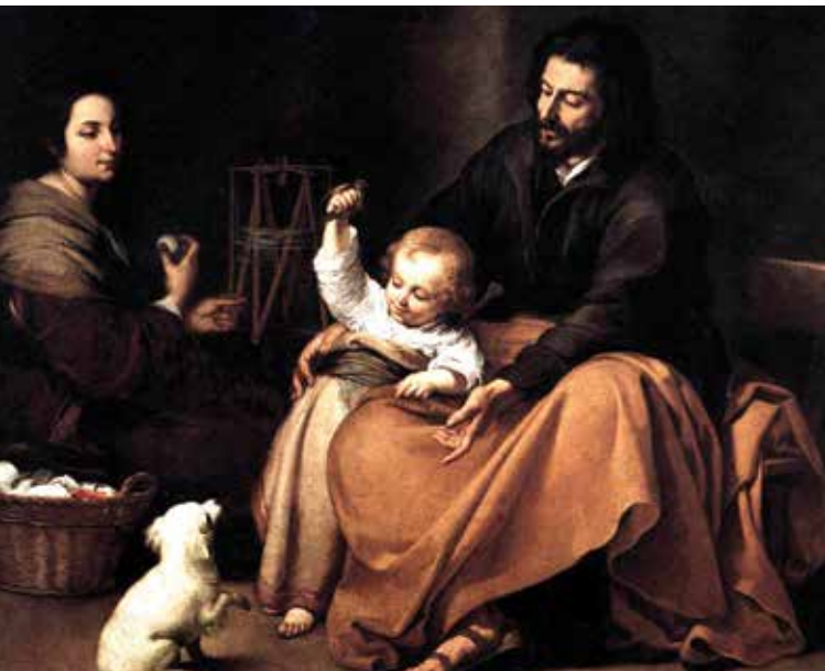
'The Holy Family with the little bird' by Bartolome Esteban Murillo

We are mindful of St Joseph who responded to God and together with Mary nurtured Jesus.