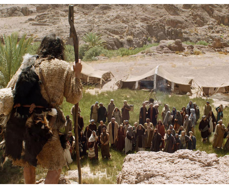
St John the Baptist be with us as we too strive to witness to God alive in our world

As we prepare to celebrate the Solemnity of the Nativity of St John the Baptist we reflect on him as one who proclaimed Jesus.