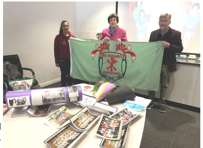
Emblem of St Joseph's Catholic Primary School and school photos before amalgamation in 2016.