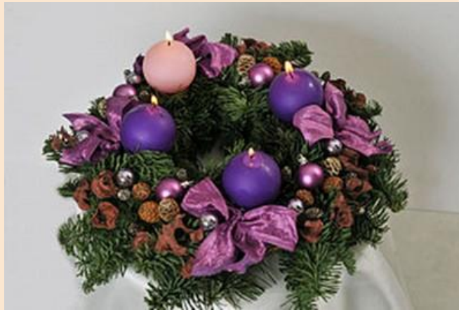
"File:Advent wreath with violet and rose candles 4.JPG"

We light this third candle for the joy we know in Christ Jesus.