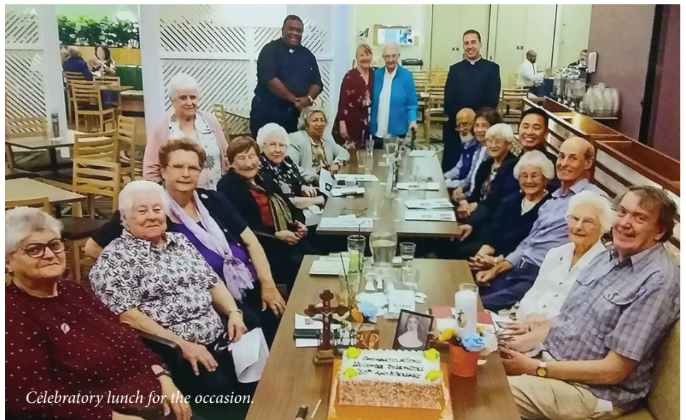
Celebratory lunch for the occasion.