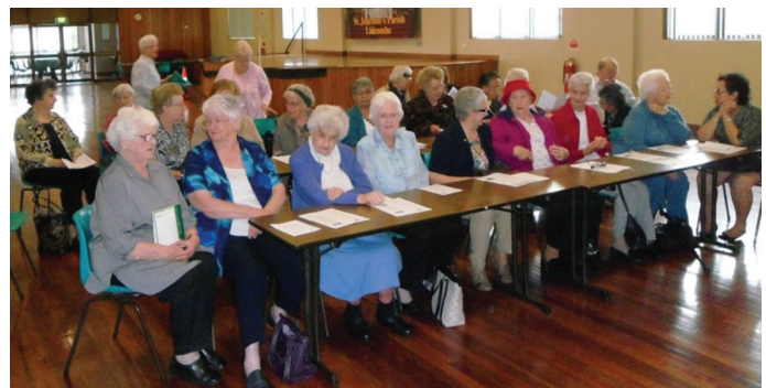
Lidcombe RSJ Associates – Monthly meeting.