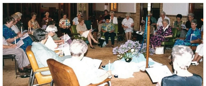
A discussion and reflection at Kincumber.