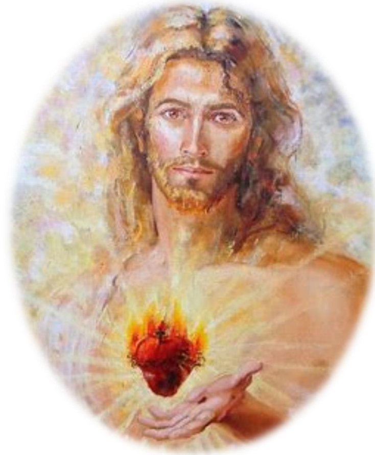
Original Oil Painting Joseph Fanelli 1993

One of the most well-known titles attributed to Jesus is the “Sacred Heart”. In Scripture, the heart is considered the centre of a person and often describes the whole person. Jesus referred to himself as the heart of God. “Come to me, all who labour and are weary and I will give you rest...For my yoke is easy, and my burden is light.” Mt 11:28-39