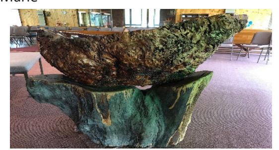
St. Brigid's Baptismal Font