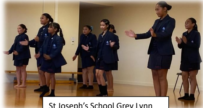
St Joseph's School Grey Lynn