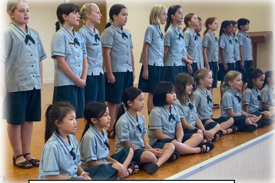
St Michael's School Remuera

It was a lovely experience to be present at a concert where nine Auckland schools with a Josephite history provided wonderful entertainment for everyone. St Michael's Remuera were very hospitable hosts for everyone who came along. The concert took place the day after St Joseph's feast day which was very special.