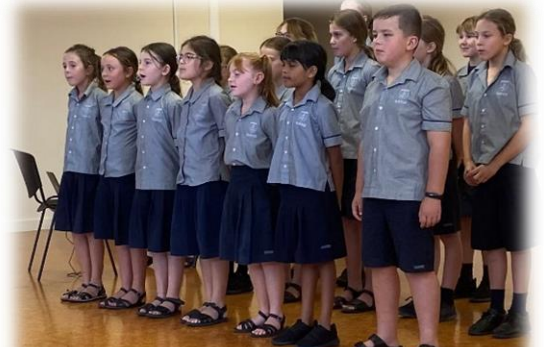
St Francis School Pt Chevalier

We hope our schools will continue to come together to celebrate being Josephite!