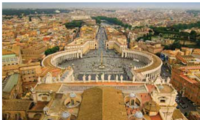
Aerial View of Vatican City.

A devotional practice where the faithful worship the Blessed Sacrament, or consecrated bread, outside of Mass. A great starting point for finding hope. You may choose to spend time in prayer, meditate on scripture or read the life of a saint, or ask for forgiveness. Conclude with a prayer such as the Our Father.