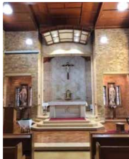
The Perthville Chapel

It is hoped that whoever purchases the Perthville site will continue a goal of helping others and hold precious the history and heritage contained in it.