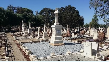
Adelaide West Terrace Cemetery