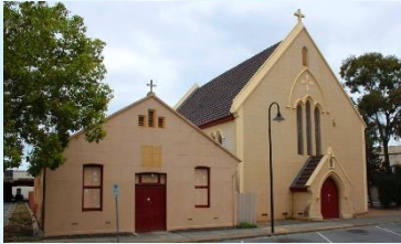
Port Adelaide St Mary's Church and School Hall