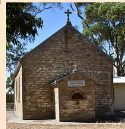
Polish Hill River Historic Church Museum

A faithful Mary MacKillop always believed in the providence of God. Mary and her Sisters travelled widely to set up schools, particularly in rural areas.