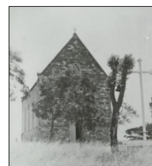
Mary Immaculate Church, Mintaro

Cost: $60 per person (includes lunch). Please advise of any dietary requirements when booking. Payment is by CASH ONLY on the day.